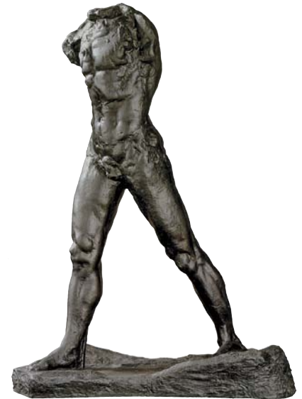
Fig. 2 Auguste Rodin, Walking Man , 1907. Bronze, 213x161x72 cm. Paris, Musée d'Orsay.