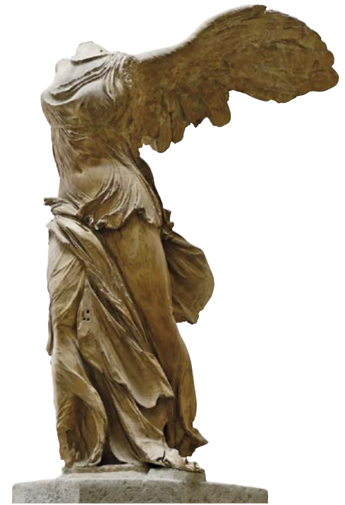
Fig. 1 Victory of Samothrace , 190 BC ca., h. 245 cm. Paris, Musée du Louvre.

Although Boccioni's figure tends toward an abstract synthesis , its true formal innovation lies elsewhere: in the breaking apart of what had always been a unitary, static and celebratory base. In Unique Forms the base is divided into two distinct supports, thereby suggesting movement that is not just bodily but is also – and especially – mental.