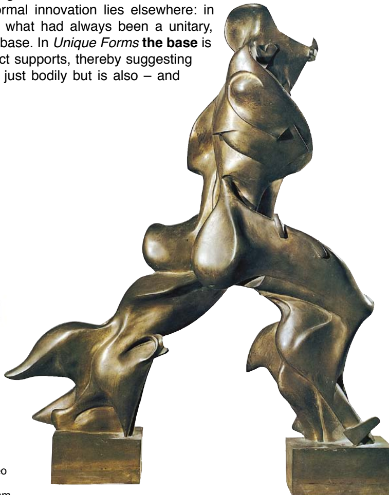
Fig. 3, 4 Umberto Boccioni, Unique Forms of Continuity in Space , 1913. Bronze, 112x40x90 cm. Milan, Museo del Novecento. Below: compositional diagram.