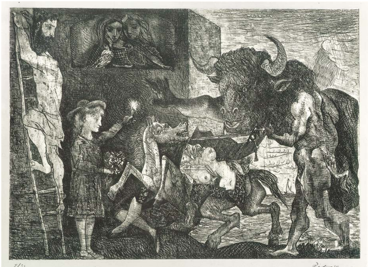
Fig. 3 Pablo Picasso, Minotauromachia , 1935. Etching, 49,6x69,6 cm. New York, The Museum of Modern Art.

In this way the painting is transformed into an allegory of pain illustrated in all its moral and physical forms. The continuous reference to classical themes, mythology, and epic poetry nourishes the scene of a real-life occurrence and raises even the most pressing current event to the level of the mythic.